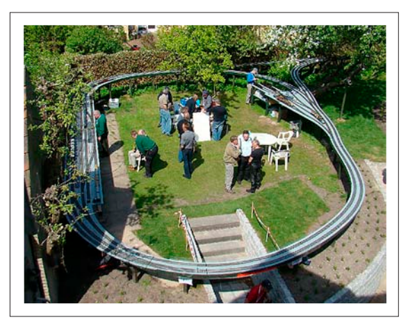
The small double circle with station area and firing up facilities.