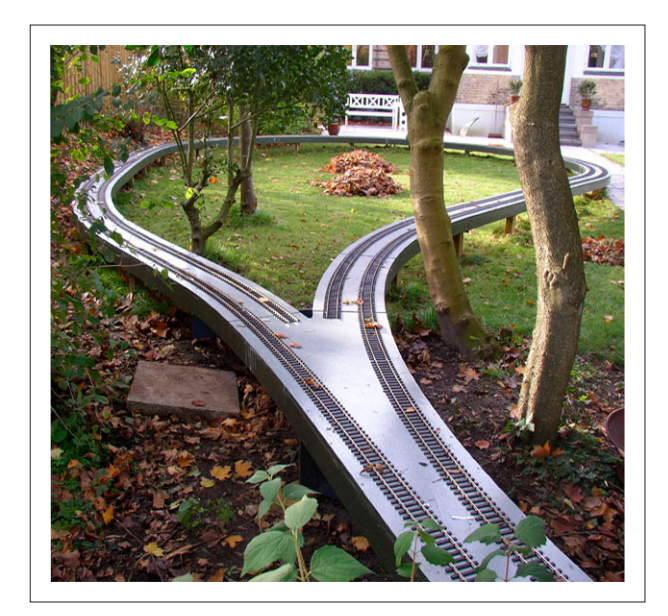
The south end of the express mainline ("folded bone")

Running on the track is naturally free. Food and refreshments can be bought on the day at very reasonable prices.